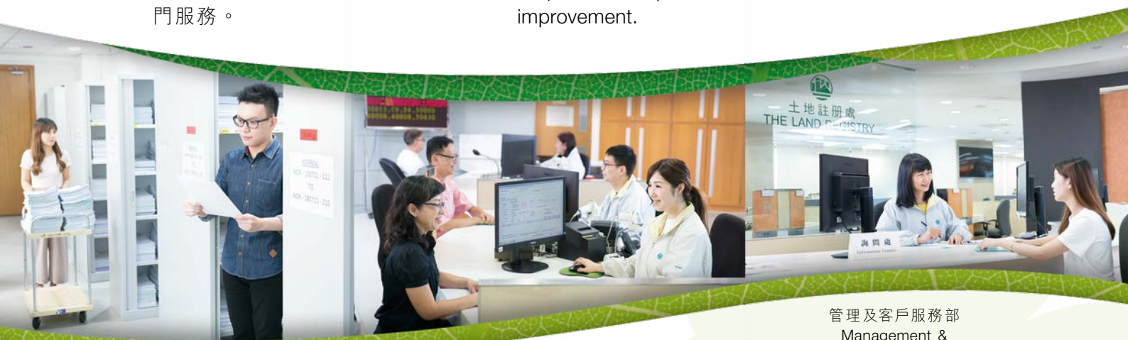
註冊服務部 Registration Services Division