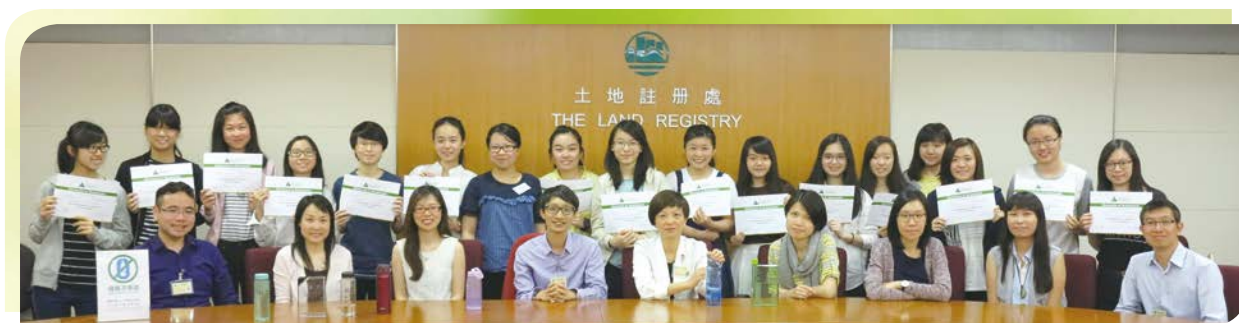
參與2017年工作影子計劃日的中學生在一天的實習計劃期間自備水樽裝水。 Secondary school students participating in the Job Shadow Day 2017 brought their own water bottles for refilling drinking water during their 1-day work attachment.

The Controlling Officer's Environmental Report 2017 with detailed environmental performance is available on the Land Registry website.