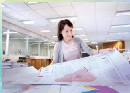
查冊及部門服務部 Search & Departmental Services Division