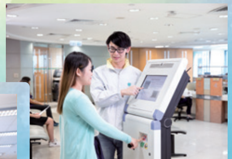
管理及客戶服務部 Management & Customer Services Division