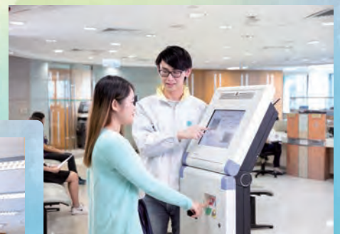
管理及客户服务部 Management & Customer Services Division