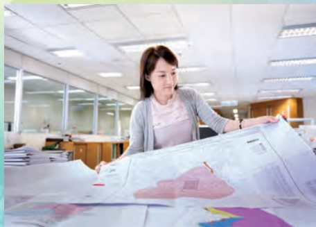
查册及部门服务部 Search & Departmental Services Division