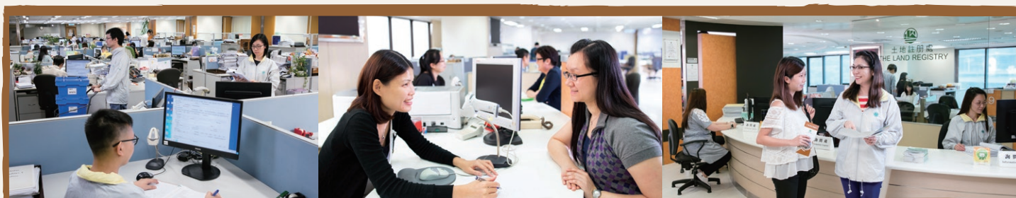
註冊服務部 Registration Services Division