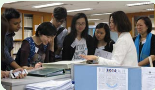
Visit by the HKU Space Po Leung Kuk Stanley Ho Community College