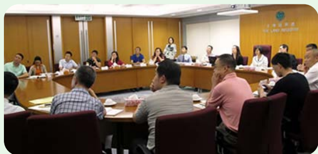
A delegation from the Land and Resources Department of Sichuan Province