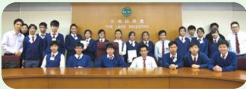
Visit by Law Ting Pong Secondary School

The feedback from the visits was positive. The students showed great interest in our work as well as the land records of the Land Registry.