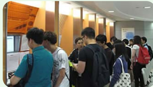
Visit by the Hong Kong Institute of Vocational Education