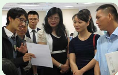
A delegation from Hainan Local Taxation Bureau

We maintain close tie with the Mainland associates. Two delegations from the Land and Resources Department of Sichuan Province and Hainan Local Taxation Bureau visited us on 20 June 2016 and 7 July 2016 respectively. The visits provided good opportunities for exchanging views on the latest developments on land registration between the Mainland and Hong Kong.