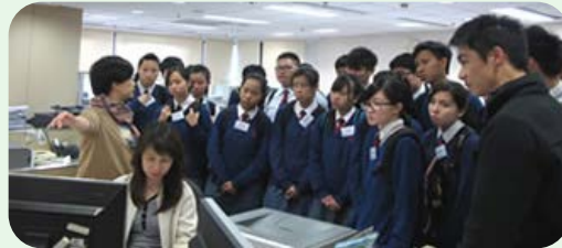
A guided tour to The Land Registry Customer Centre